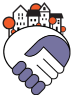
BERNAL HEIGHTS Neighborhood Center